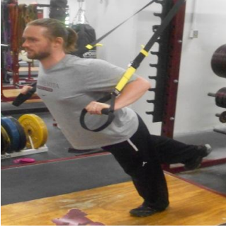
2) Chest Press SL