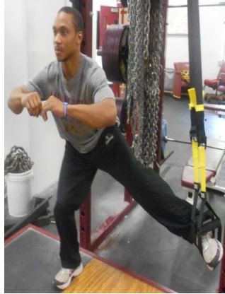
4) Abducted Lunge