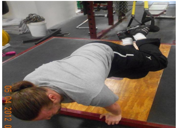
8) Push up + Oblique Crunch