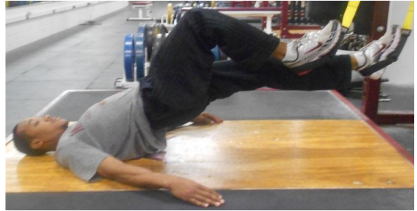
7) Alternating Hamstring Curl