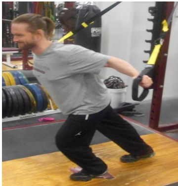
5) Chest Fly