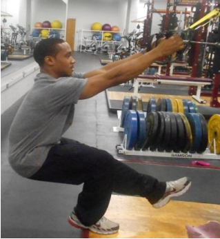
1) SL Squat