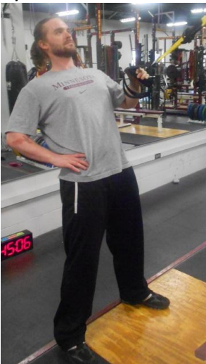
3) SA Row