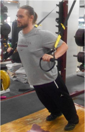
2) Chest Press