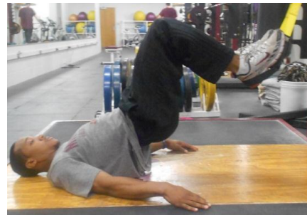
7) Hamstring Curl