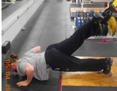
5) Single Leg Incline Press